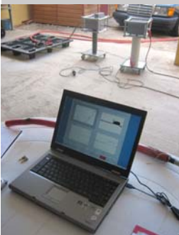
On-Site Cable Testing