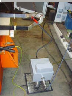
TD Measurement on Motor Bars