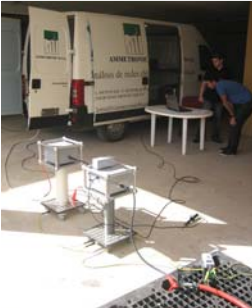
ICMflex & HV Filter